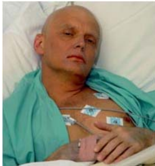
Mr Litvinenko in hospital, a few days before his death.