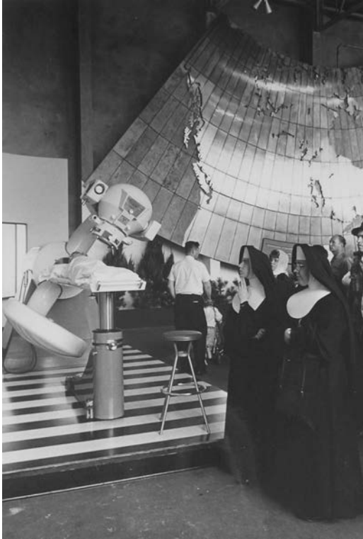
Figure 4. People looking at a Theratron in the Canada Pavilion at the Seattle Worlds's Fair, June 1962.