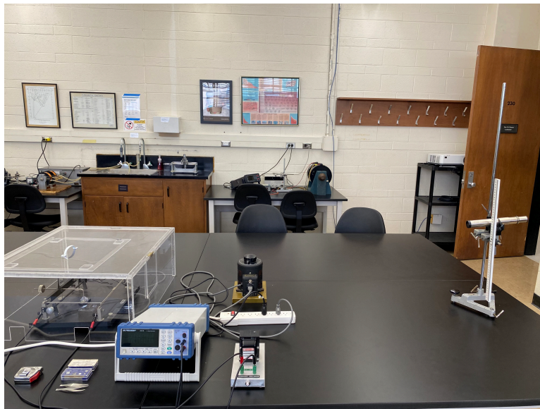
Figure 1: The current balance setup

where I is the current through each wire, d is the distance between the wires and \mu_o is the fundamental physical constant to be determined in this experiment.