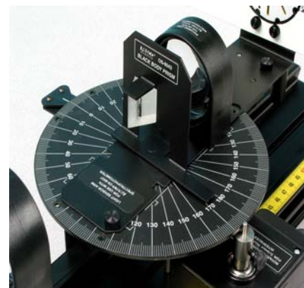
Figure 3: Prism Orientation

Acquisition Software: Open the Blackbody Radiation Labview application using the desktop shortcut. Do not turn the acquisition ON yet! Turn on the Signal Generator (switch is at the back).